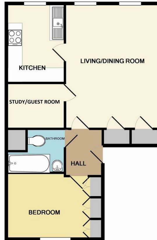
TOTAL APPROX. FLOOR AREA 602 SQ.FT. (55.9 SQ.M.)

Referral Fees- With a view to offer a smooth and comprehensive service we may at times recommend various associated services and companies. These include financial advisors and surveyors. You, the consumer are never under any obligation to use any of these services if you have preferences elsewhere. For these services we may receive referral fees from the service provider. Should you take up any of our surveyor referrals we may receive a fee as follows; from Tomblesons Surveyor's £15 voucher, Daniells Harrison Surveyors £50, Connells Surveyors £100.