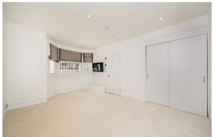
Warwick Gardens, W14