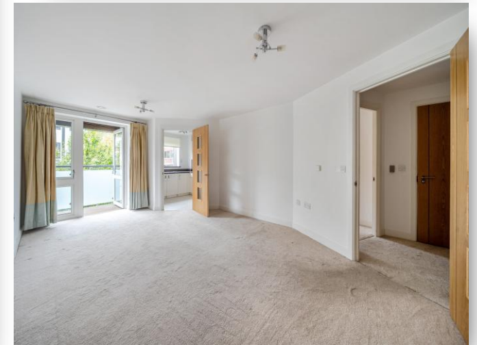
Flat 10 Elgar Place, 3-6 Bridge Avenue, Maidenhead SL6 1BP