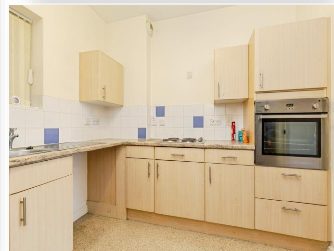
Hartfields Manor, Hartlepool, TS26 0US