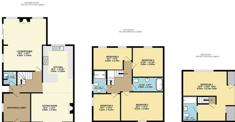
TOTAL FLOOR AREA: 2078 sq.ft (193.0 sq.m) approx. Whilst every attempt has been made to ensure the accuracy of the floorplan contained here, measurements of doors, windows, rooms and any other items are approximate and no responsibility is taken for any error, omission or mis-statement. This plan is for illustrative purposes only and should be used as such by any prospective purchaser. The services, systems and appliances shown have not been tested and no guarantee as to their operability or efficiency can be given. Made with Metroplan ©2026

Mobile & Broadband: We understand that mobile coverage and broadband services, including fibre to the premises, are available. For further information on providers, predicted speeds, and mobile coverage, please refer to the Ofcom checker.