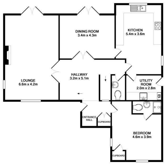
GROUND FLOOR APPROX. FLOOR AREA 104.9 SQ.M. (1129 SQ.FT.)