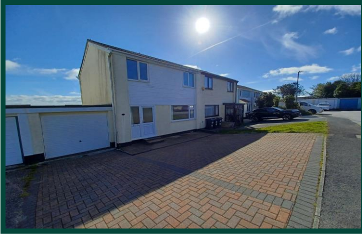
Front Elevation & Driveway