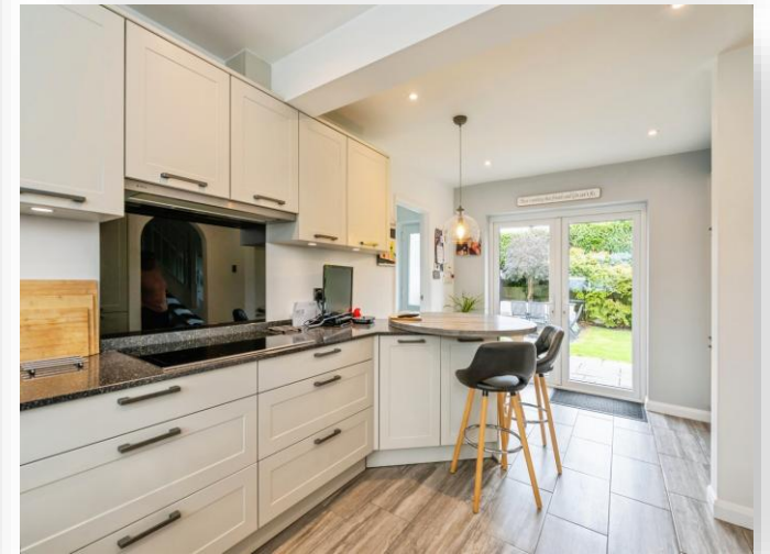
Inglewood Drive,BOGNOR REGIS PO21 4JX