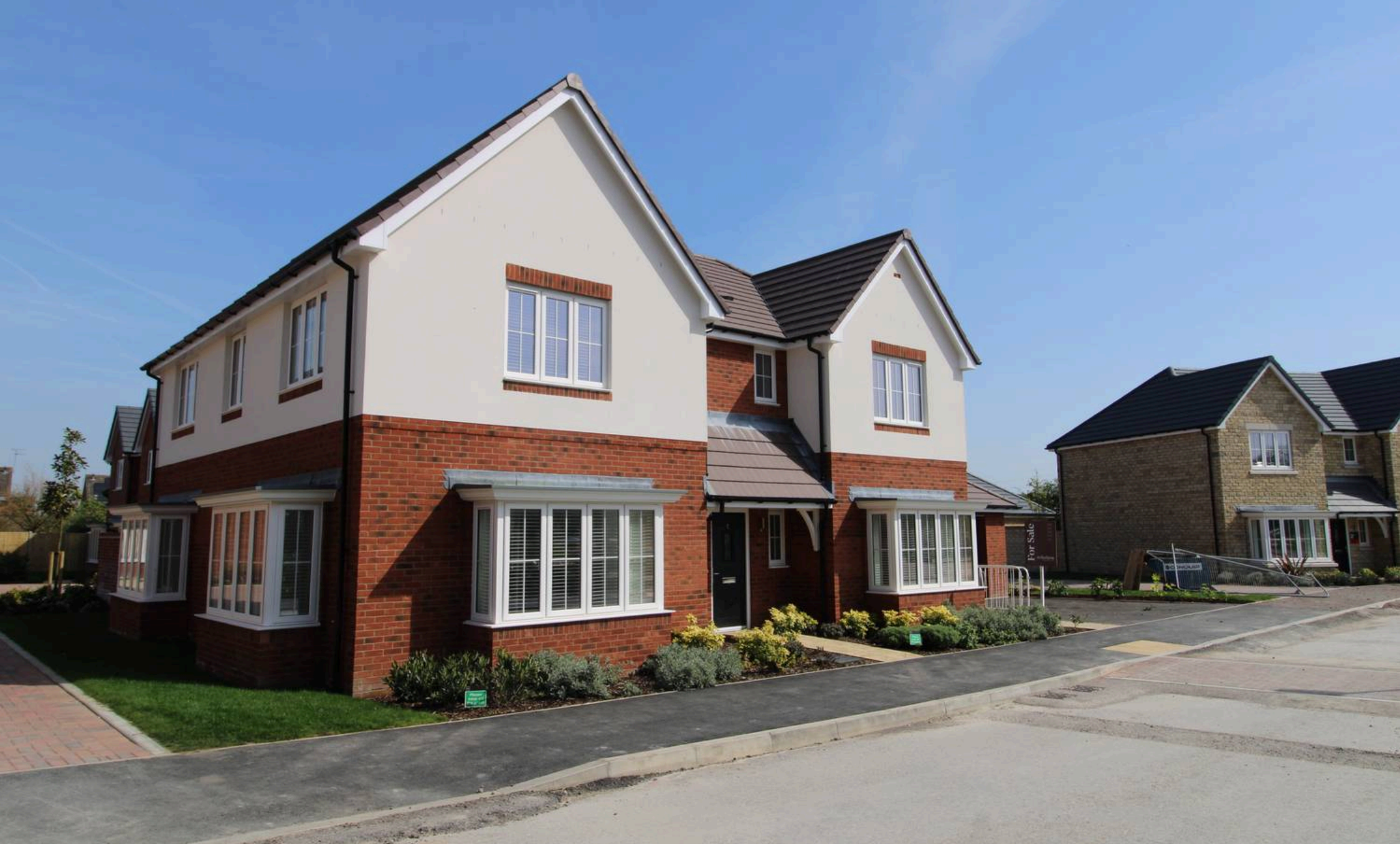
The Yew, Restrop Road, Purton Wiltshire