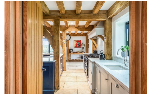
The Old Pond House | £1,750,000 Rudd Lane, Upper Timsbury, Hampshire SO51 0NU