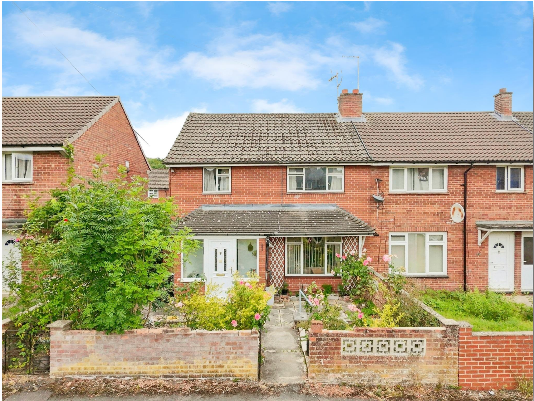
Imber Walk, Swindon, SN2 5NZ