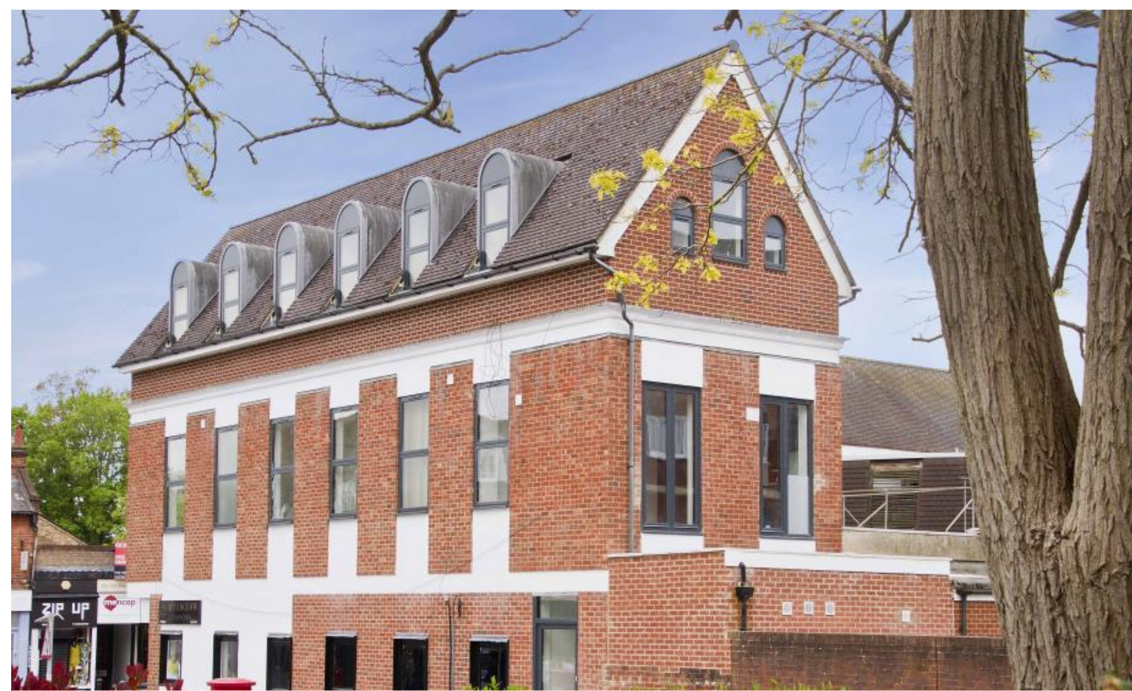
A modern one bedroom apartment set in the heart of Rickmansworth High Street, Rickmansworth, WD3 1AJ