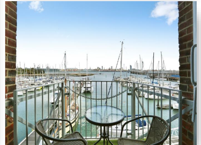
The Granary & Bakery, Weevil Lane, Gosport, PO12 1FX