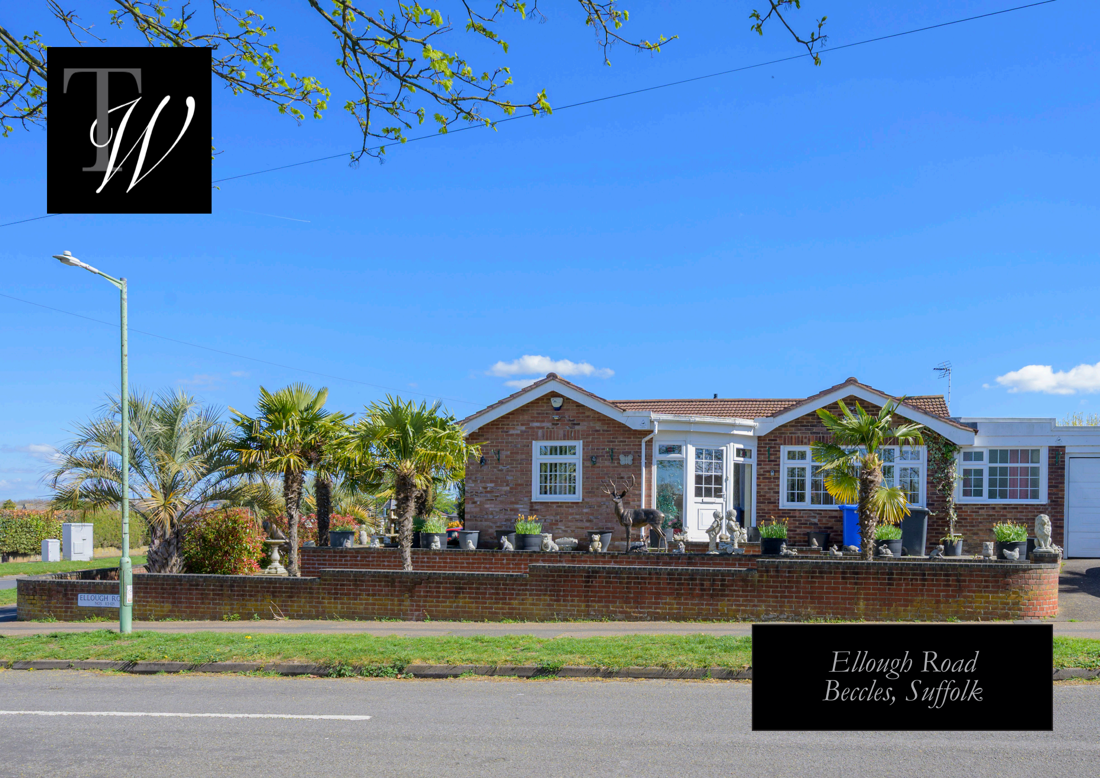
Ellough Road Beccles, Suffolk