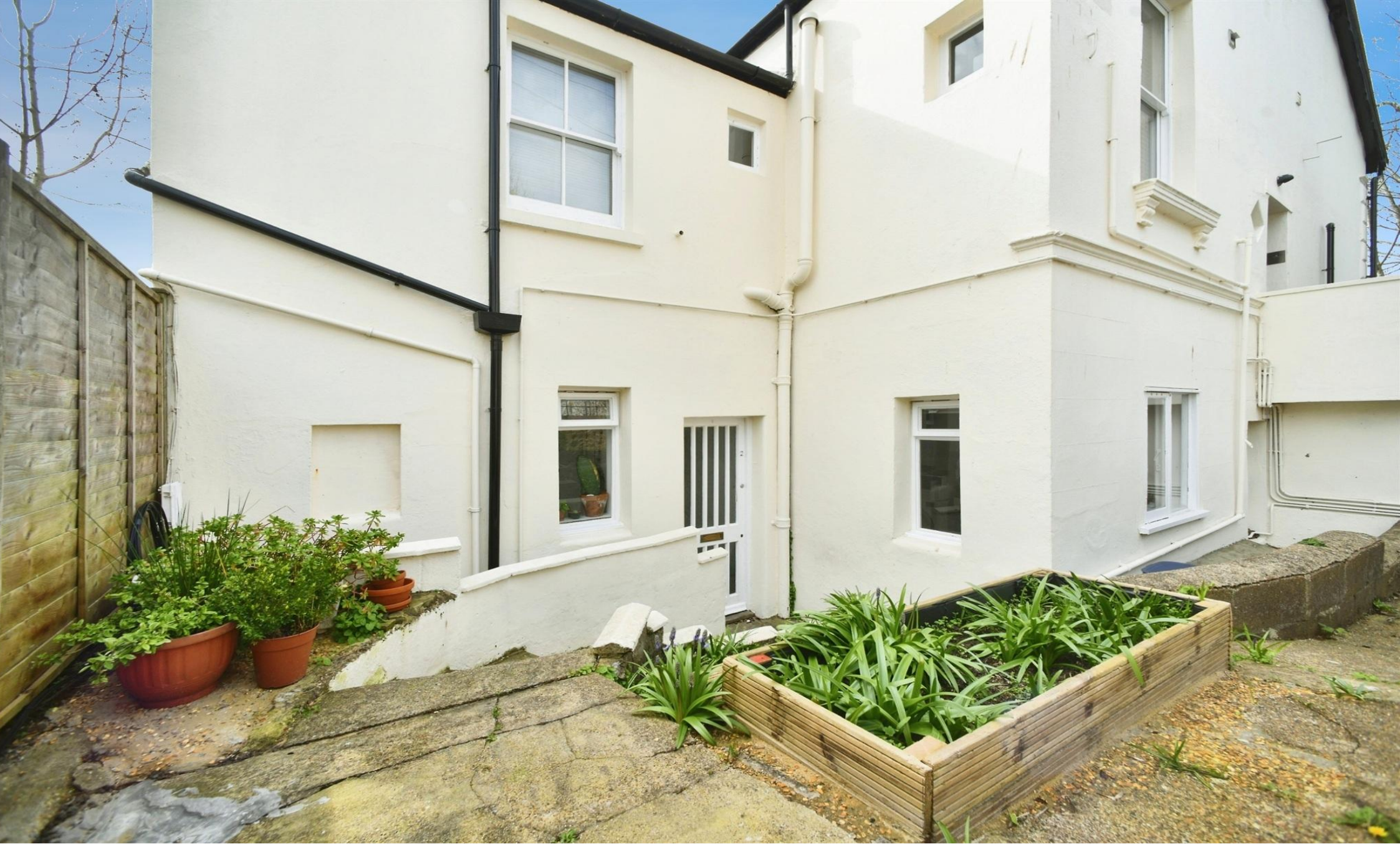
Beaconsfield Villas, Brighton, BN1 6HD