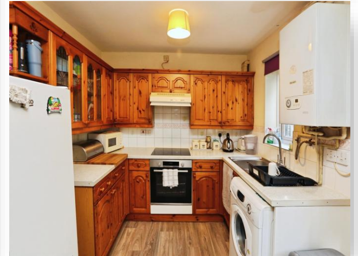
Lanyard Drive, Gosport PO13 9UY