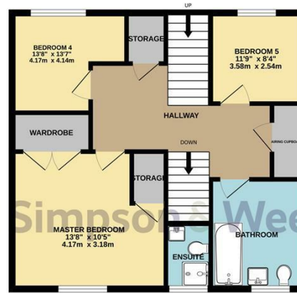
1ST FLOOR 592 sq.ft. (55.0 sq.m.) approx.