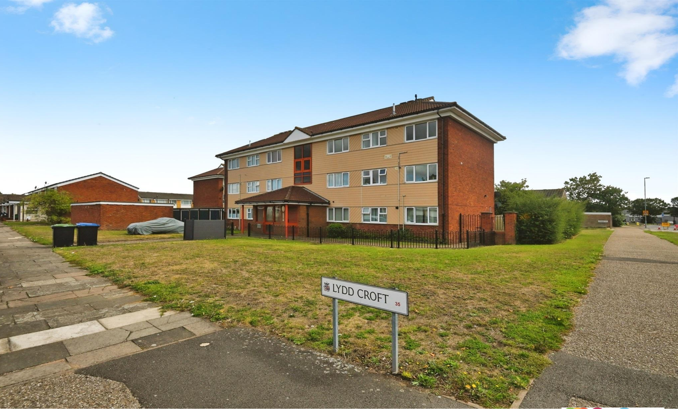
Lydd Croft, Birmingham B35 6PW