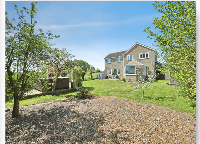
Bull Close, East Tuddenham, Dereham, NR20 3LX