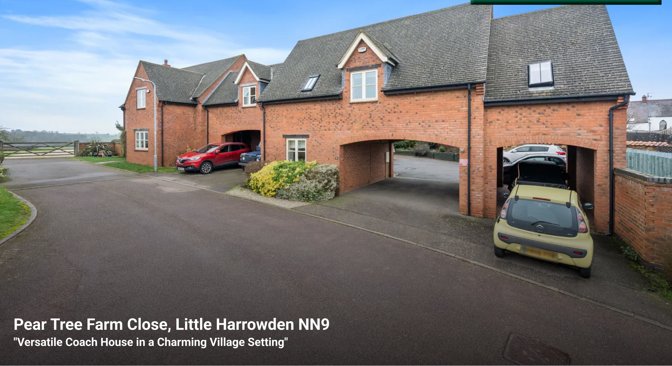
Pear Tree Farm Close, Little Harrowden NN9 "Versatile Coach House in a Charming Village Setting"