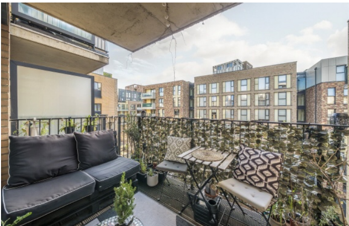
Blackheath Hill, SE10