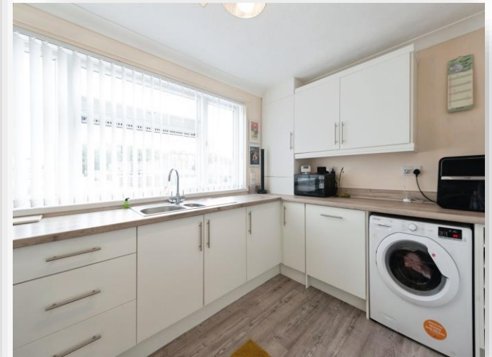
Harbridge Court, Havant PO9 4ES