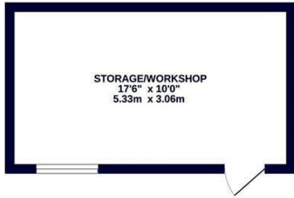
OUTBUILDING 175 sq.ft. (16.3 sq.m.) approx.