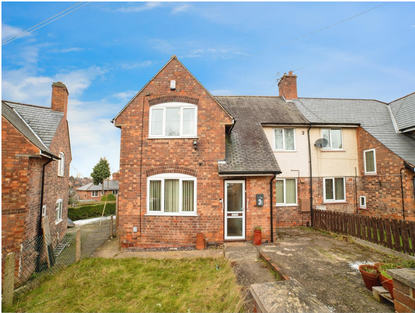
Collin Green, Nottingham NG5 3EJ