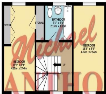
1ST FLOOR 390 sq.ft. (36.2 sq.m.) approx.