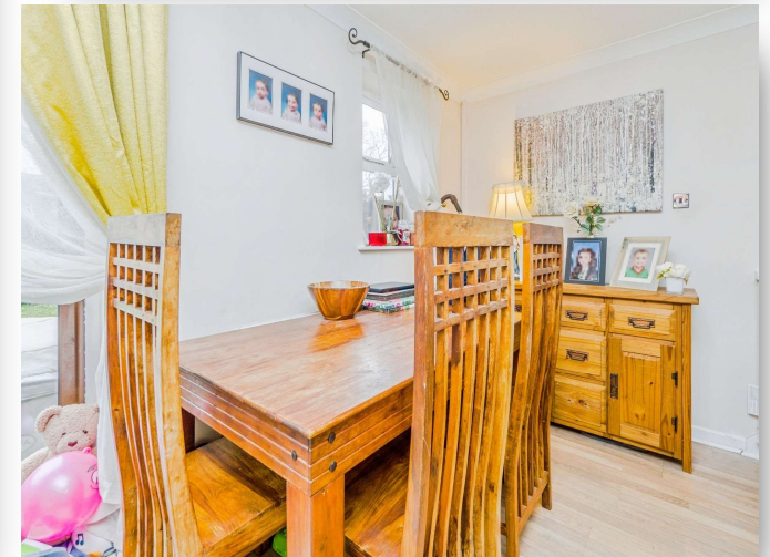
Thrush Close, St. Mellons Cardiff CF3 0PE