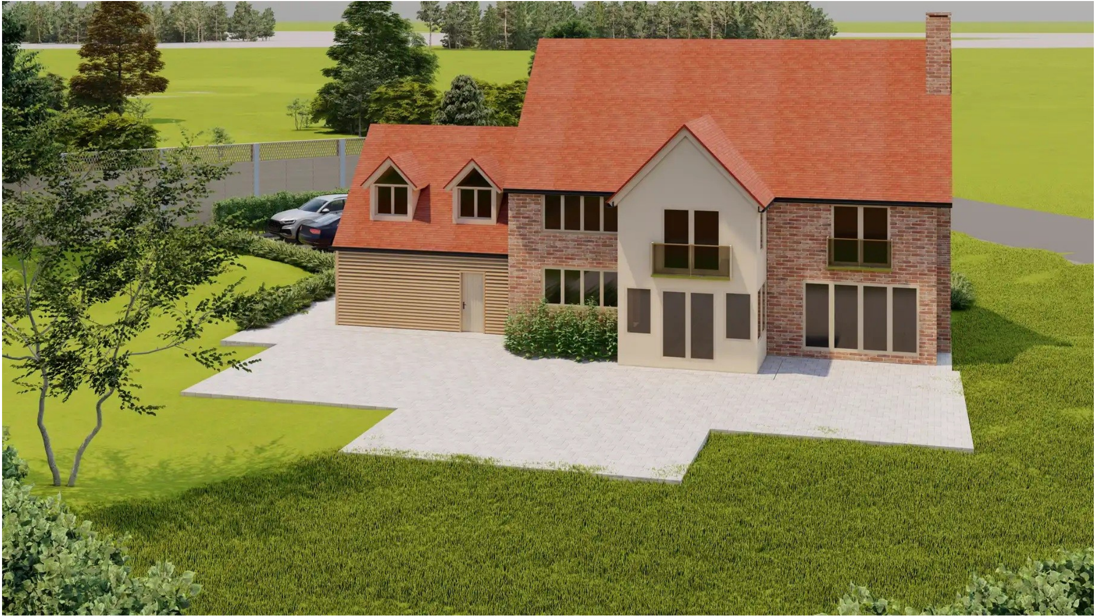
*CGI image of potential building style