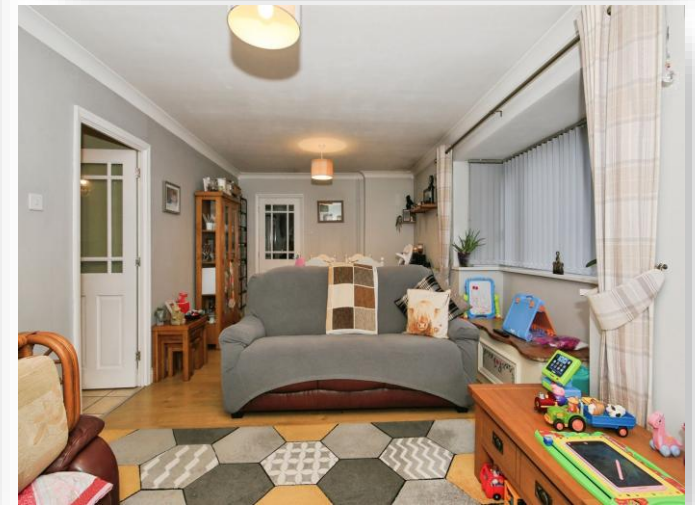
Bevills Close, Doddington PE15 0TT