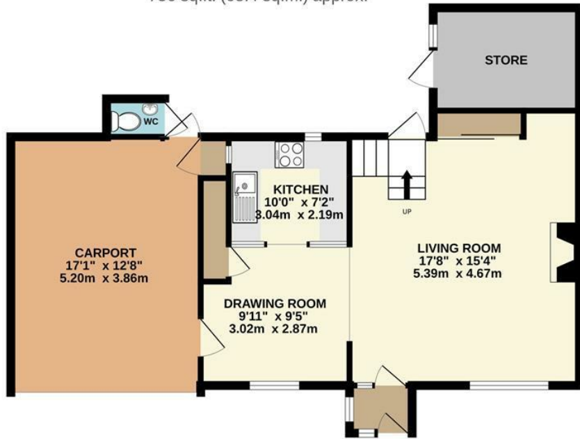
GROUND FLOOR 736 sq.ft. (68.4 sq.m.) approx.