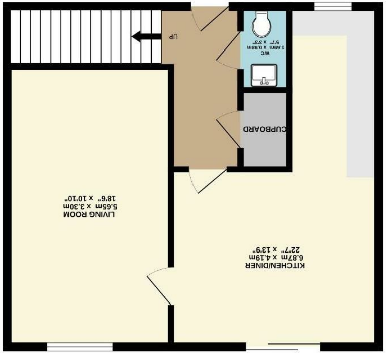
GROUND FLOOR (554 sq.ft.) approx.

TOTAL FLOOR AREA : 99.0 sq.m. (1066 sq.ft.) approx. Whilst every attempt has been made to ensure the accuracy of the floorplan contained here, measurements of doors, windows, rooms and any other items are approximate and no responsibility is taken for any error, omission or mis-statement. This plan is for illustrative purposes only and should be used as such by any prospective purchaser. The services, systems and appliances shown have not been tested and no guarantee as to their operability or efficiency can be given. Made with Metropix ©2026