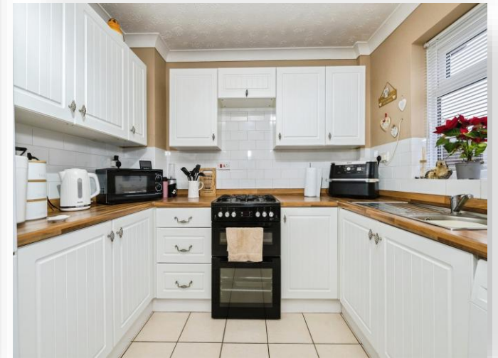
Elm Close, Yaxley Peterborough PE7 3YW