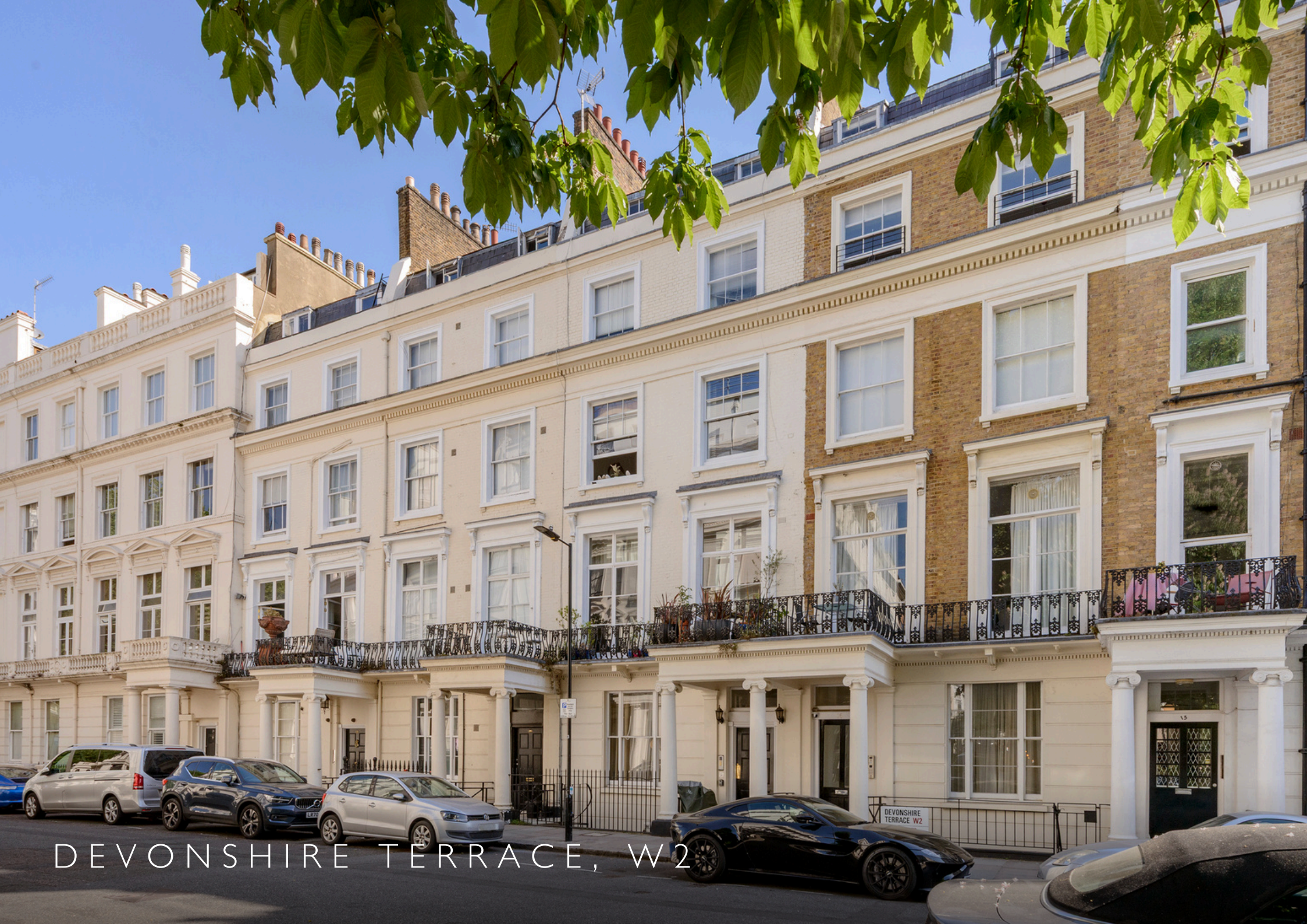
DEVONSHIRE TERRACE, W2