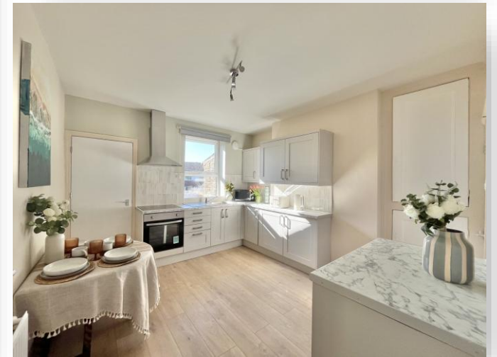
North Lodge Avenue, Harrogate HG1 3HX