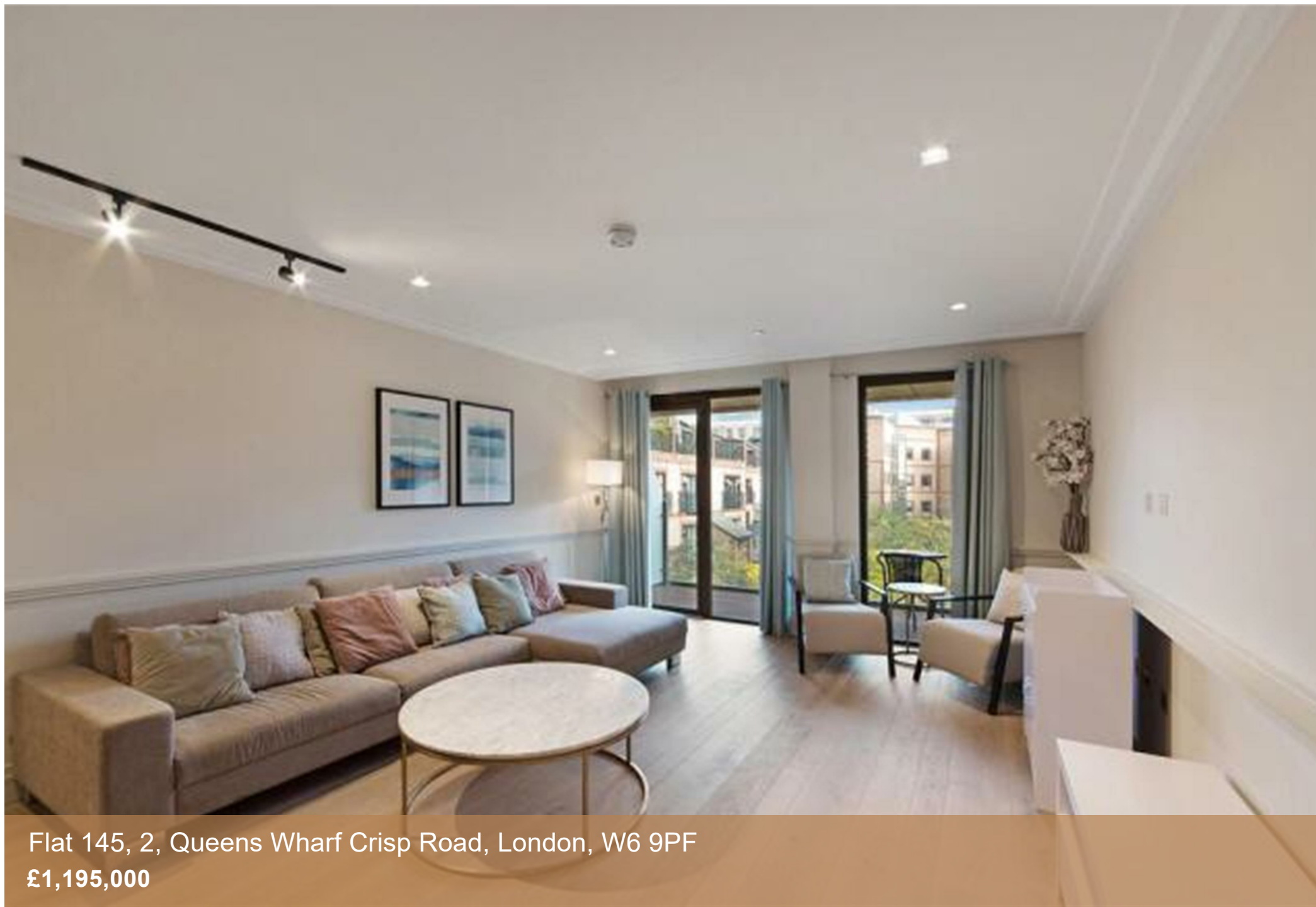
Flat 145, 2, Queens Wharf Crisp Road, London, W6 9PF £1,195,000