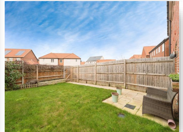
Nightjar Road, Holt NR25 6GA