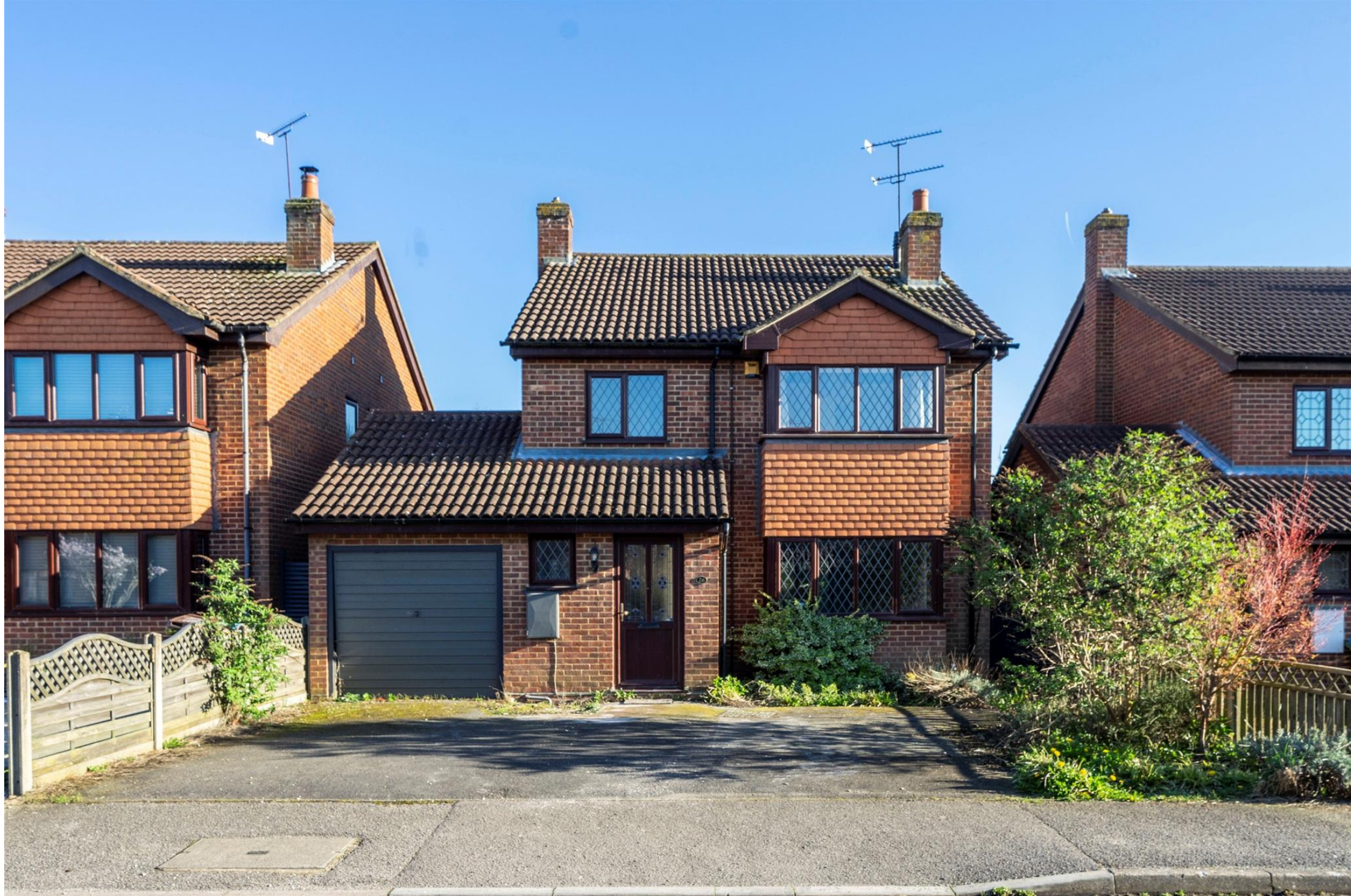
RUSHENDON FURLONG, PITSTONE, LU7 9QX