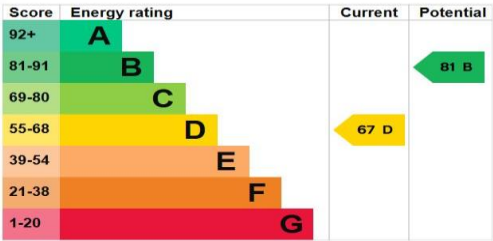
The graph shows this property's current and potential energy rating.