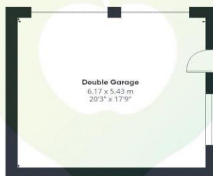
Floor 1 Building 2