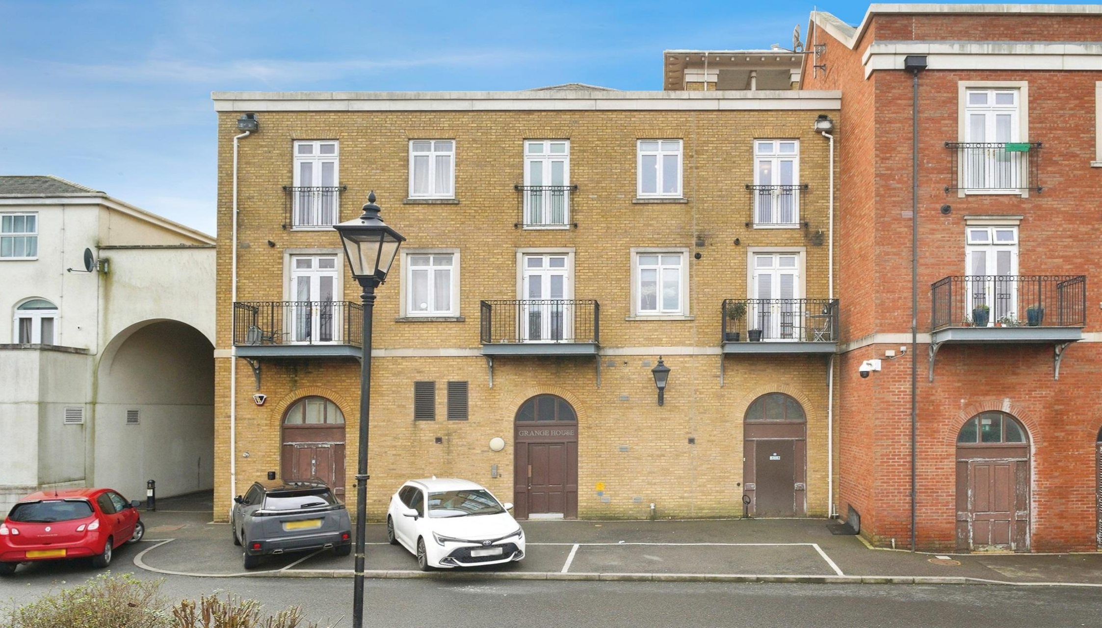
Grange House, Main Street, Shirley, Solihull