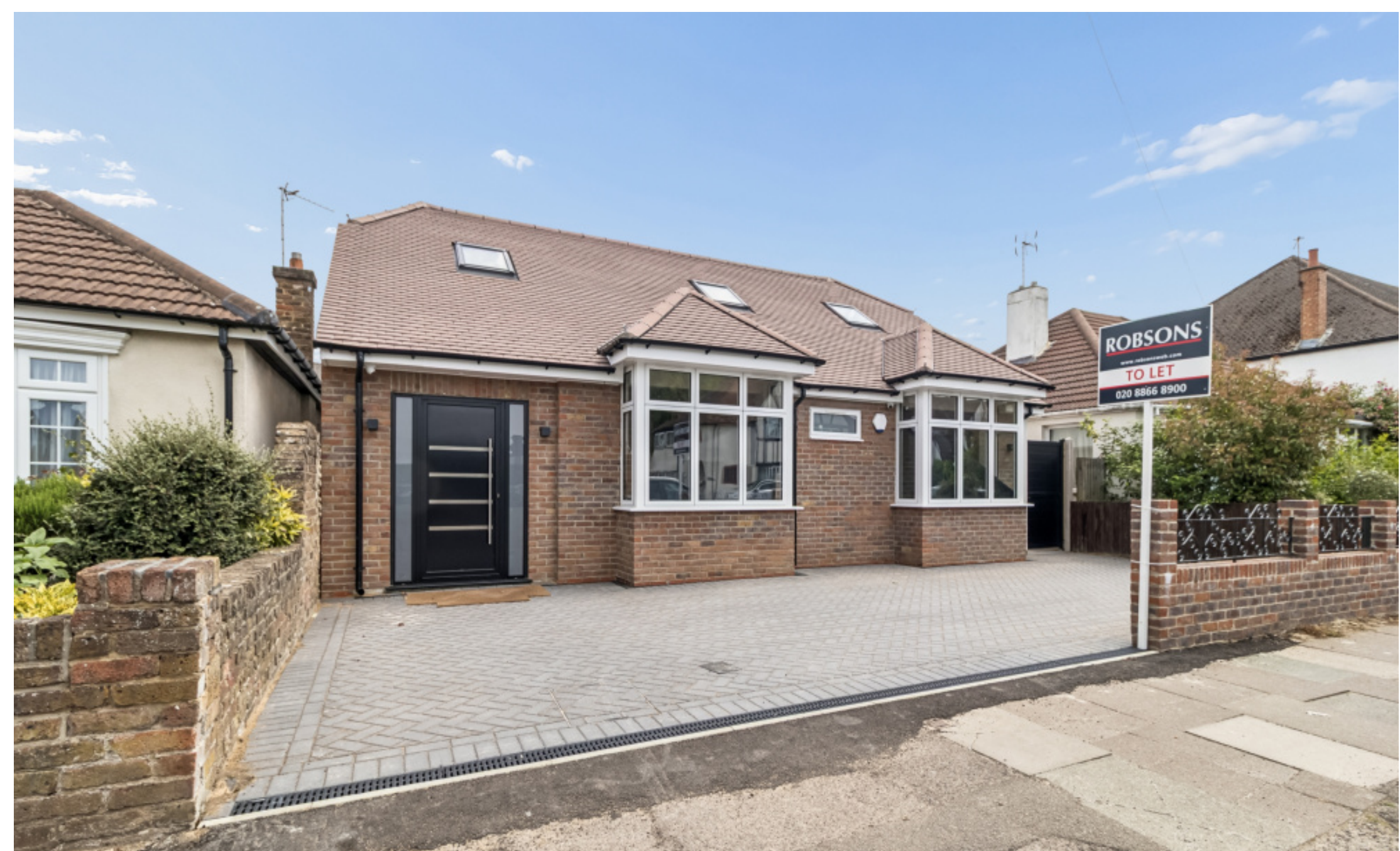
A four bedroom detached family home in a sought after location Lime Grove, Pinner, HA4 8RY