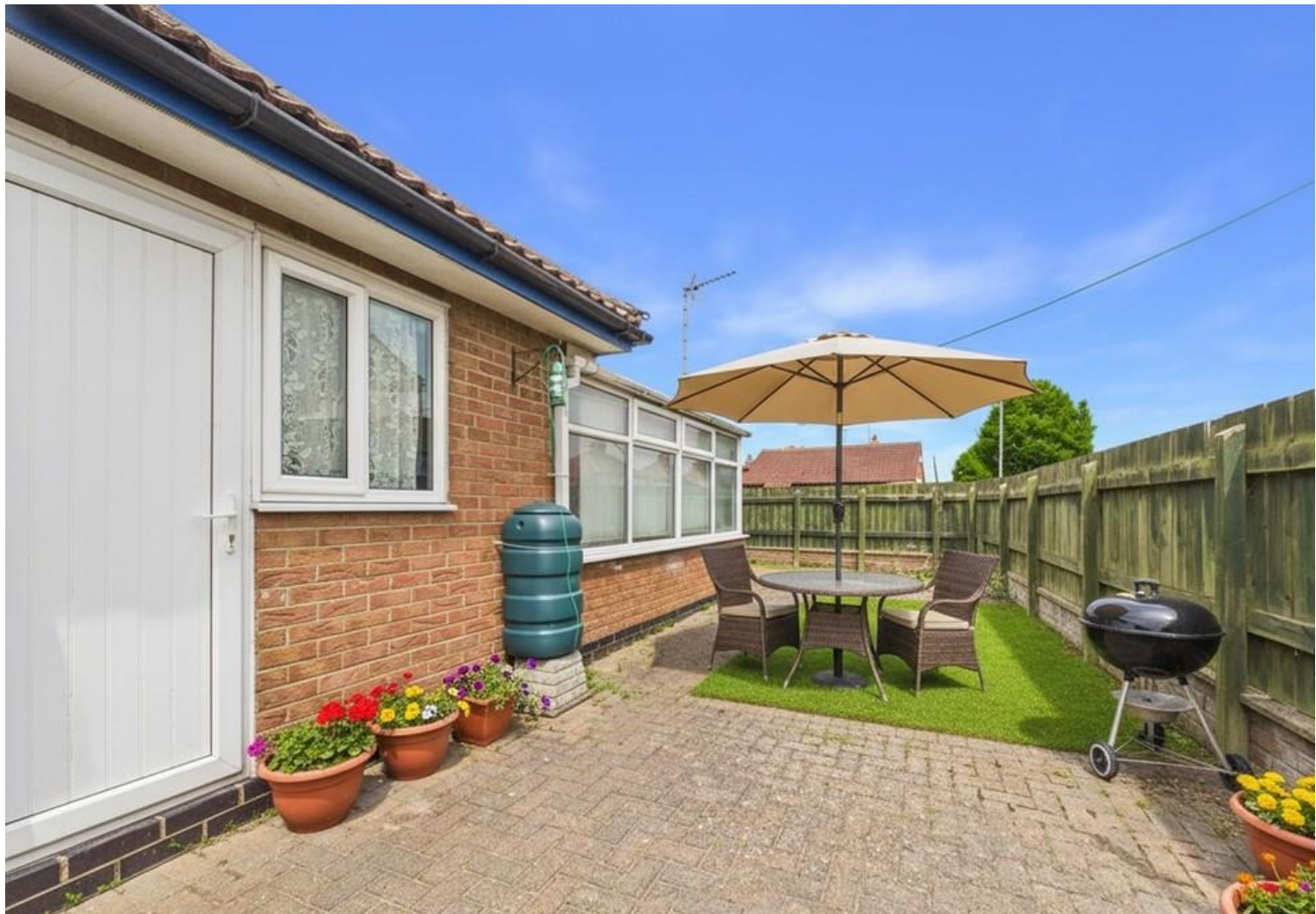
Garden - VIRTUALLY STAGED