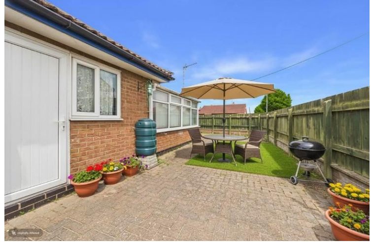
Garden - VIRTUALLY STAGED