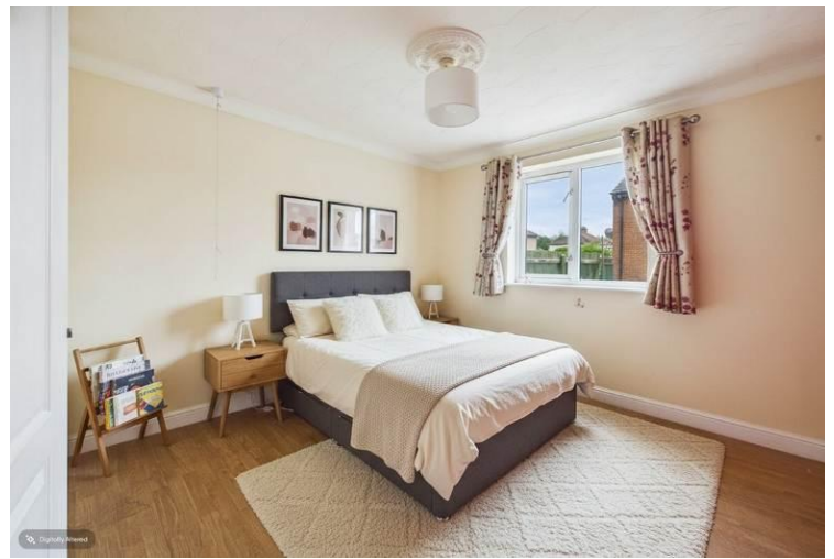
Bedroom 2 - VIRTUALLY STAGED