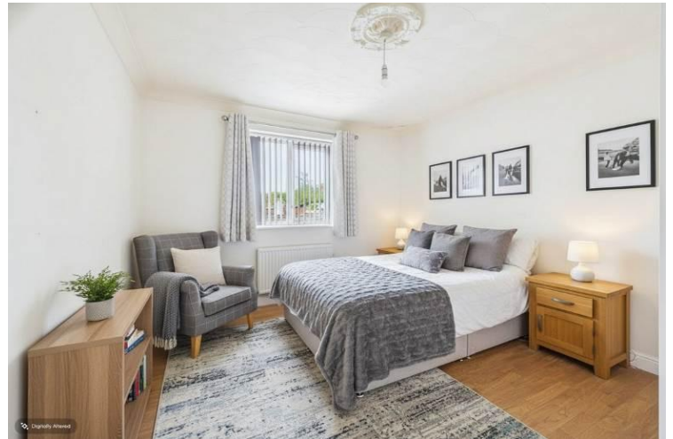
bedroom 1 - VIRTUALLY STAGED