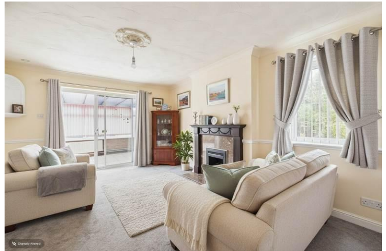
Lounge - VIRTUALLY STAGED