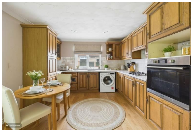
Kitchen - VIRTUALLY STAGED