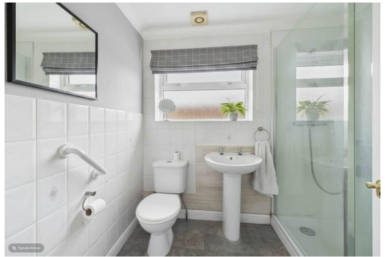
Bathroom - VIRTUALLY STAGED