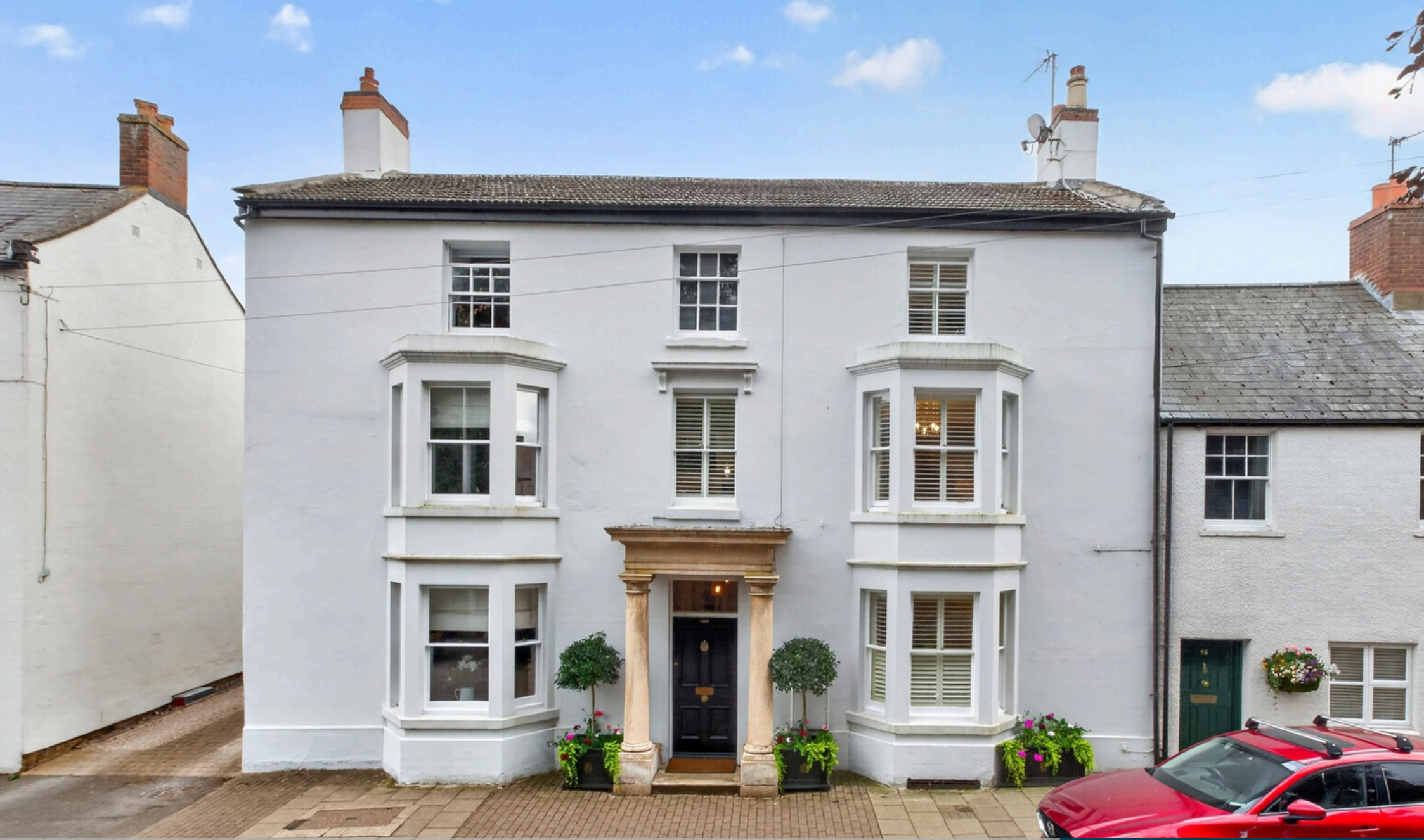
COMPTON HOUSE HIGH STREET EAST, UPPINGHAM