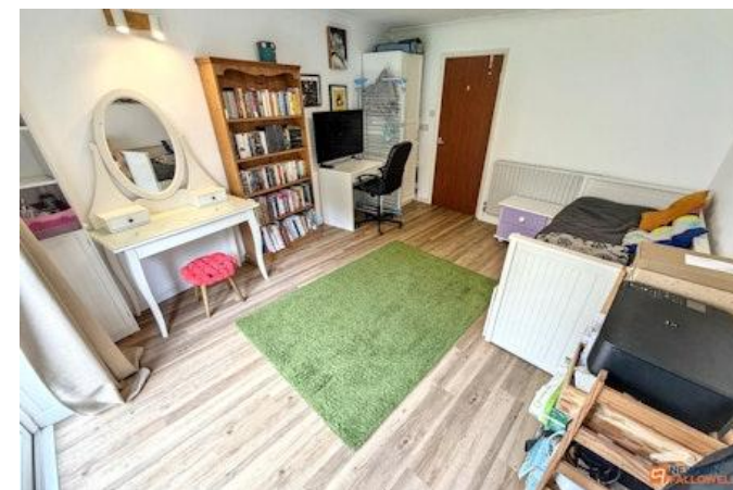
Bedroom One 2.81m x 4.36m (9'2" x 14'4")