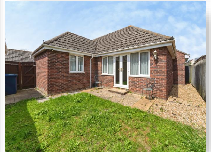
White Horse Gardens, March PE15 8AG