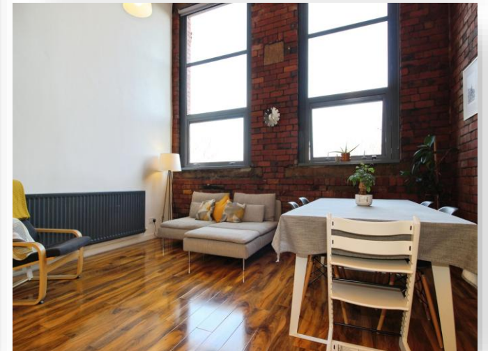
Old School Lofts Whingate, Leeds LS12 3BW