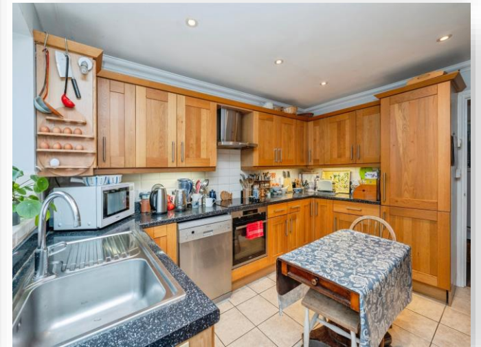
Low Wood, The Street, Erpingham, Norwich, NR11 7QB