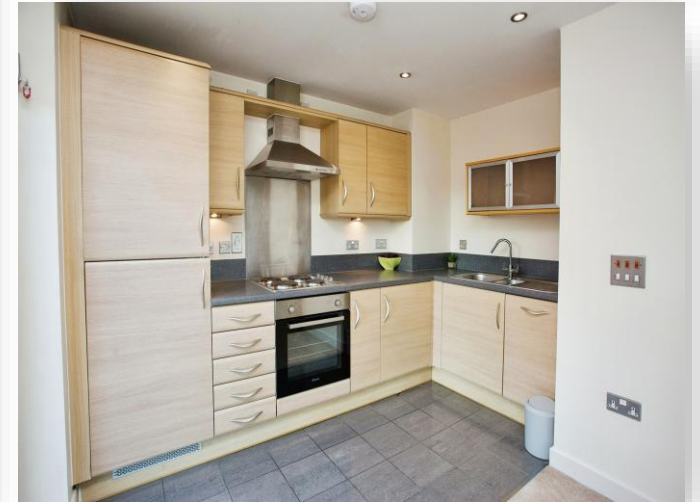
Harlequin Court, Rope Quays, Gosport, PO12 1EQ