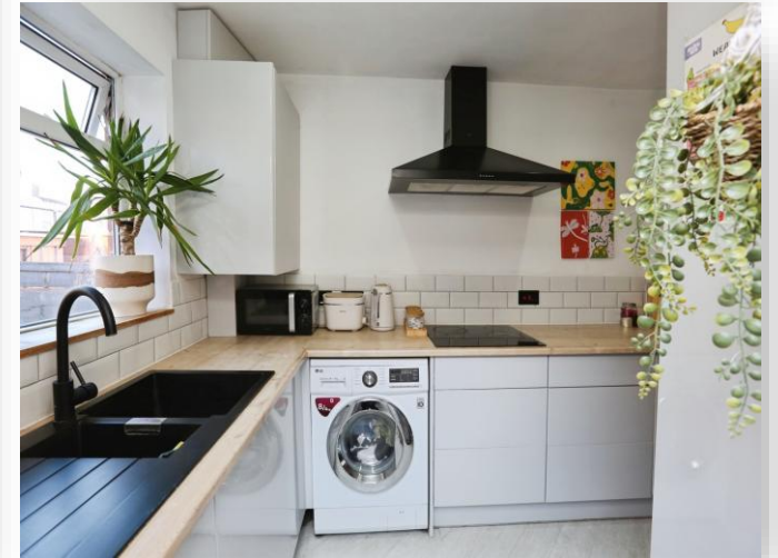
St. Anns Crescent, Gosport PO12 3JS