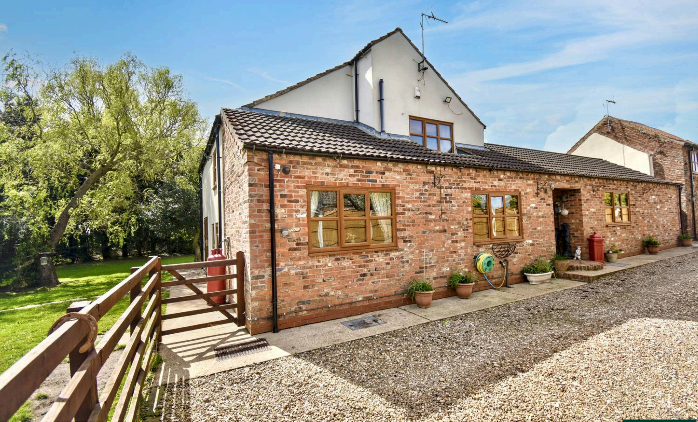
Old Laithe Farm Scunthorpe Road, Thorne £650,000