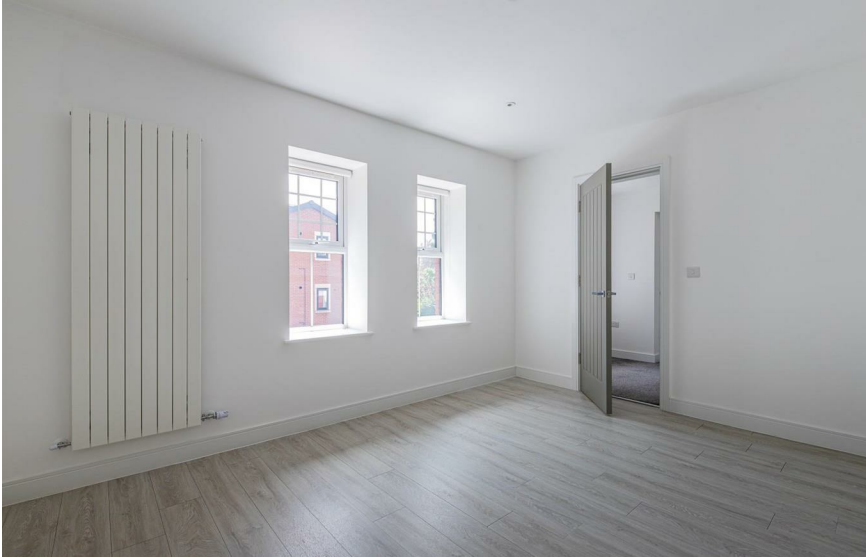
3 Lozelles Block C