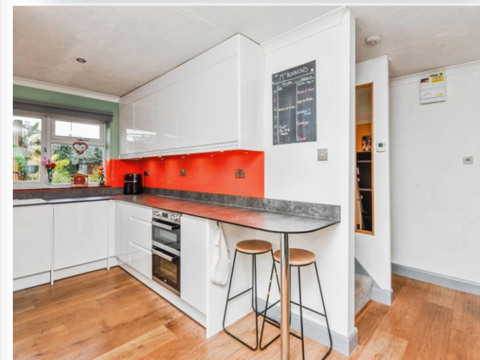
Ludlow Close, Westbury BA13 3TQ